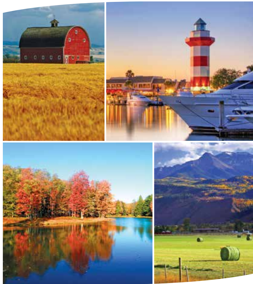
In-network coverage from coast to coast

Highmark Inc. and Highmark Health Insurance Company are PPO plans with a Medicare contract. Enrollment in Highmark Inc. and Highmark Health Insurance Company depends on contract renewal. Highmark is a registered mark of Highmark Inc. Highmark Blue Shield and Highmark Health Insurance Company are independent licensees of the Blue Cross and Blue Shield Association. Freedom Blue, Blue Cross, Blue Shield and the Cross and Shield symbols are registered service marks of the Blue Cross and Blue Shield Association.